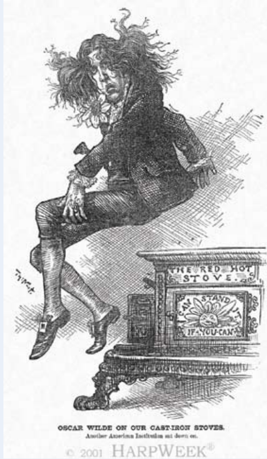
Thomas Nast, "Oscar Wilde on Our Cast-Iron Stoves," Harper's Weekly, published September 19, 1882.