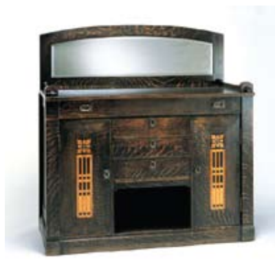
Shop of the Crafters, Sideboard , Cincinnati, ca. 1910, oak, inlay of various woods, and coppered metal. Cincinnati Art Museum, Gloria W. Thomson Fund for Decorative Arts, 1989.107