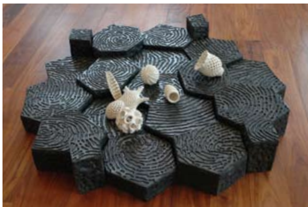
Ana England, Touching The Sea , 7.5" x 37" x 34", 2007, Naked Raku and Porcelain.